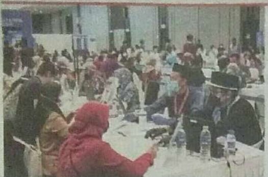
Volunteers clad in Hari Raya attire attending to vaccine recipients at the Bangi Avenue Convention Centre vaccination centre yesterday.